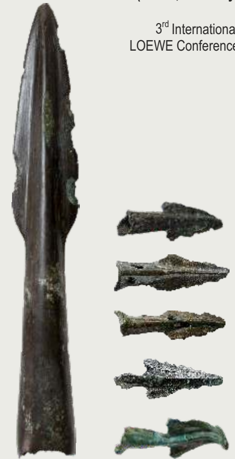
Sängersberg, Bad Salzschlirf. Arrowheads and a lance tip, late Bronze Age.